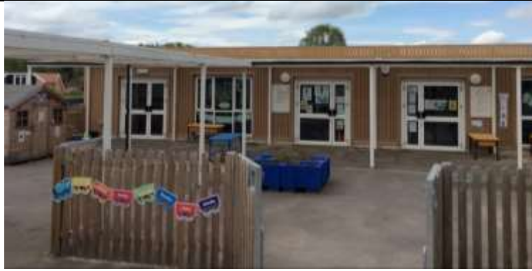
Phase 2 Expansion