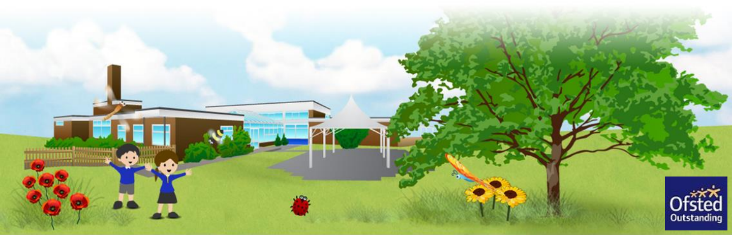
Trumps Green Infant School is committed to safeguarding, child protection and promoting the welfare of children and young people. We expect all members of the school community including staff, parents, carers, volunteers and governors to demonstrably share this commitment.