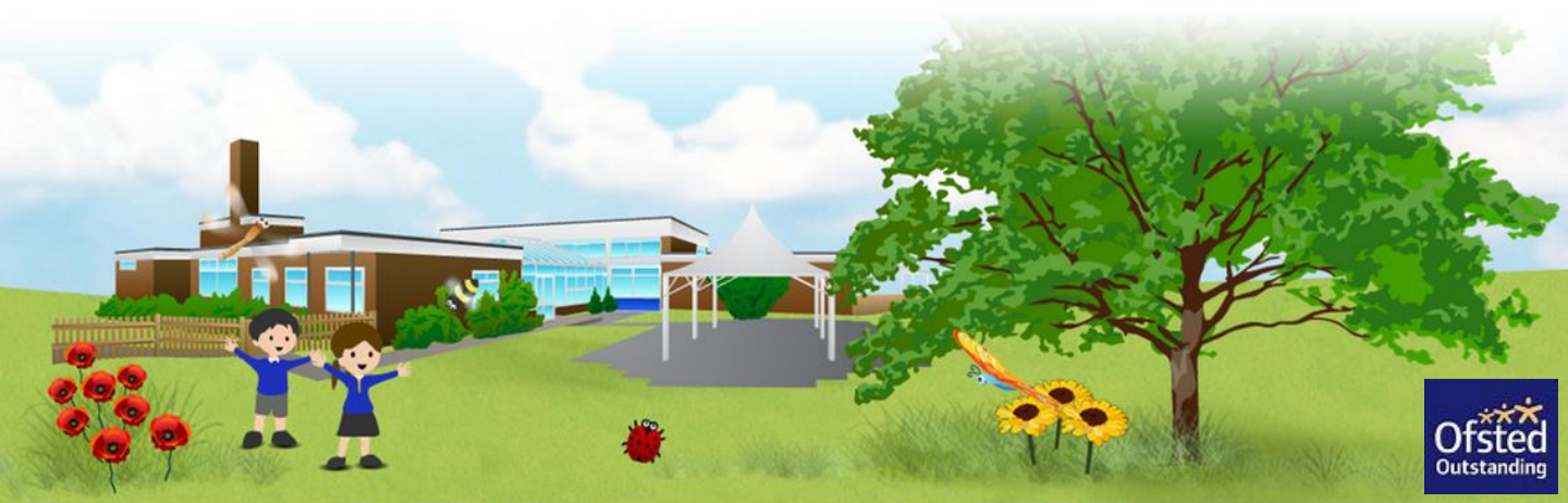
Trumps Green Infant School is committed to safeguarding, child protection and promoting the welfare of children and young people. We expect all members of the school community including staff, parents, carers, volunteers and governors to demonstrably share this commitment.

We are sure the children will enjoy explaining phenomena they witnessed.