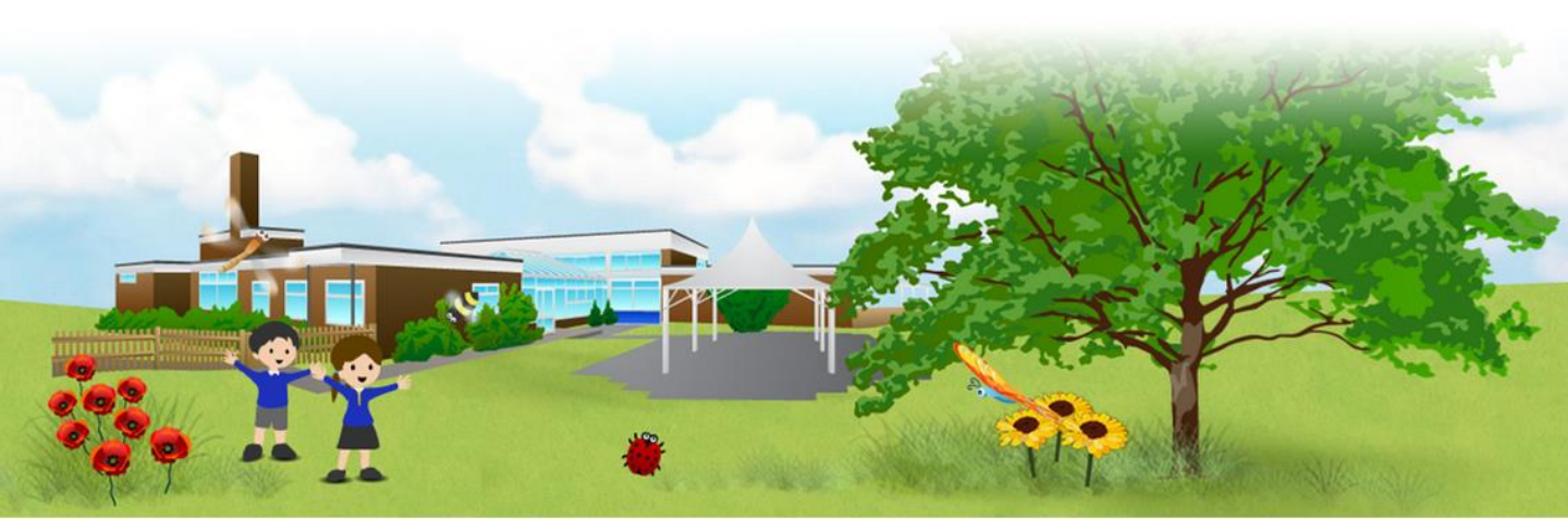
Trumps Green Infant School is committed to safeguarding, child protection and promoting the welfare of children and young people. We expect all members of the school community including staff, parents, carers, volunteers and governors to demonstrably share this commitment.

Thank you so much to the FOTG for funding this amazing visit and experience for the children.